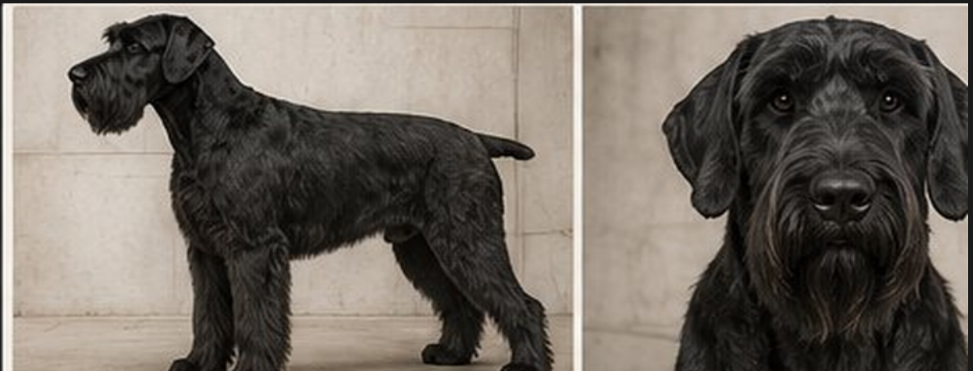
A CLEAN, BALANCED GROOM — COMFORTABLE, FUNCTIONAL, AND TRUE TO THE BREED.